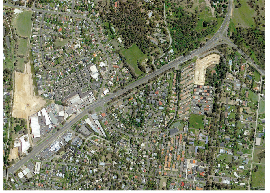
DigitalGlobe. (2018). [Lilydale aerial photograph]. Retrieved December, 2020, from Google Earth Pro.