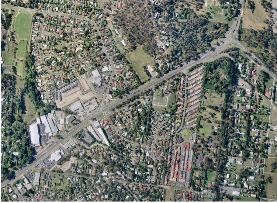
DigitalGlobe. (2006). [Lilydale aerial photograph]. Retrieved December, 2020, from Google Earth Pro.