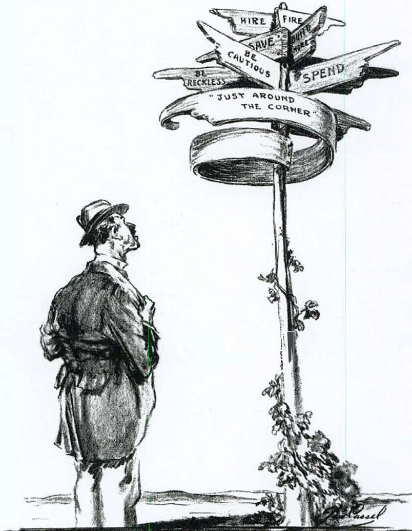
THE WAY TO PROSPERITY.