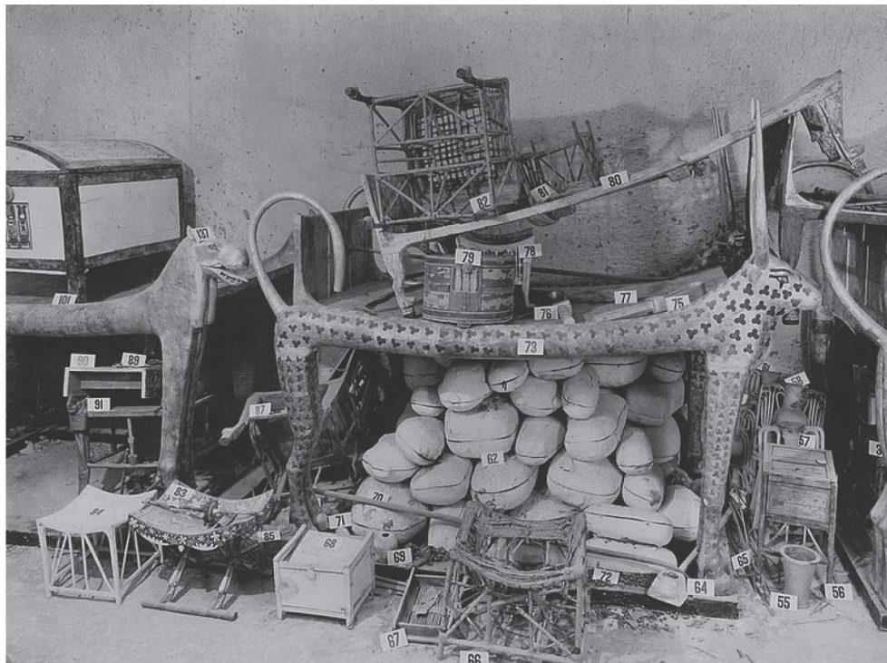
Photograph taken by Harry Burton in December 1922. Visible are artefacts including animal-headed couches, boxes of meat, alabaster vases and other goods, as they were found by Carter along the west wall of the Antechamber in Tutankhamun's tomb. Cards with reference numbers were added by Carter's team.