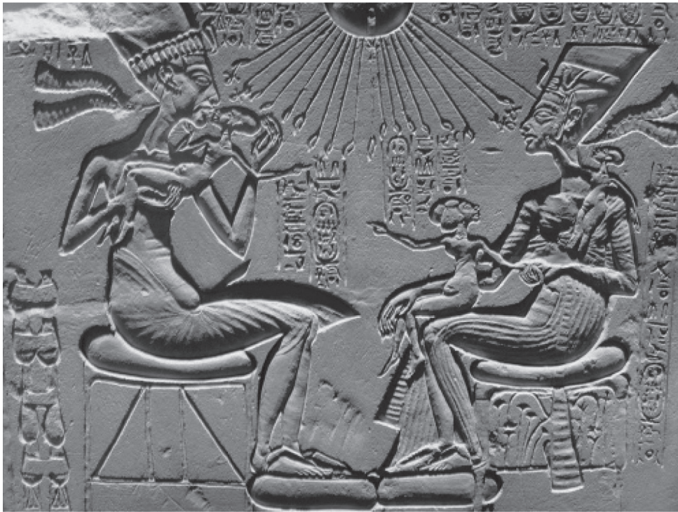
A house altar found in the city of Akhetaten. It shows Akhenaten, Nefertiti and three of their daughters.