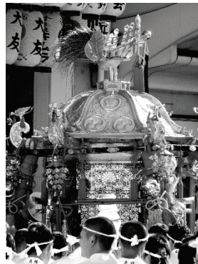
(おみこし: a mikoshi portable shrine)

ぼくの家近くではおまつりはないので、おみこしをかつぐのは生まれてはじめて でした。