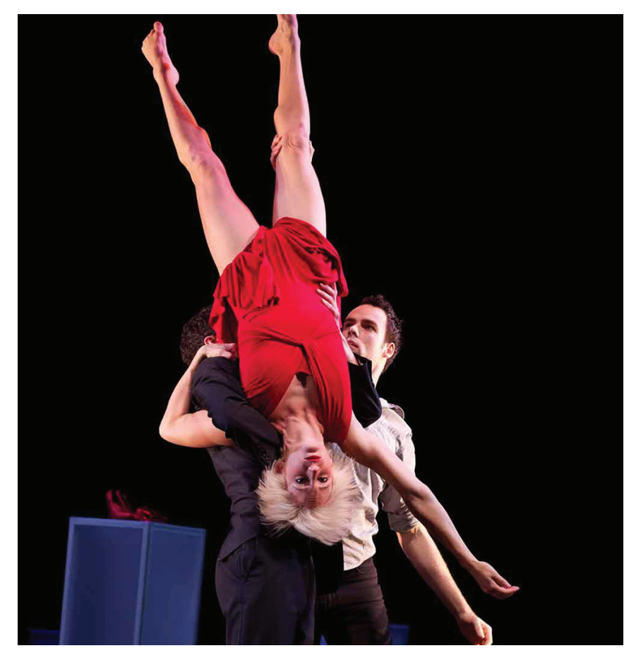
See next page