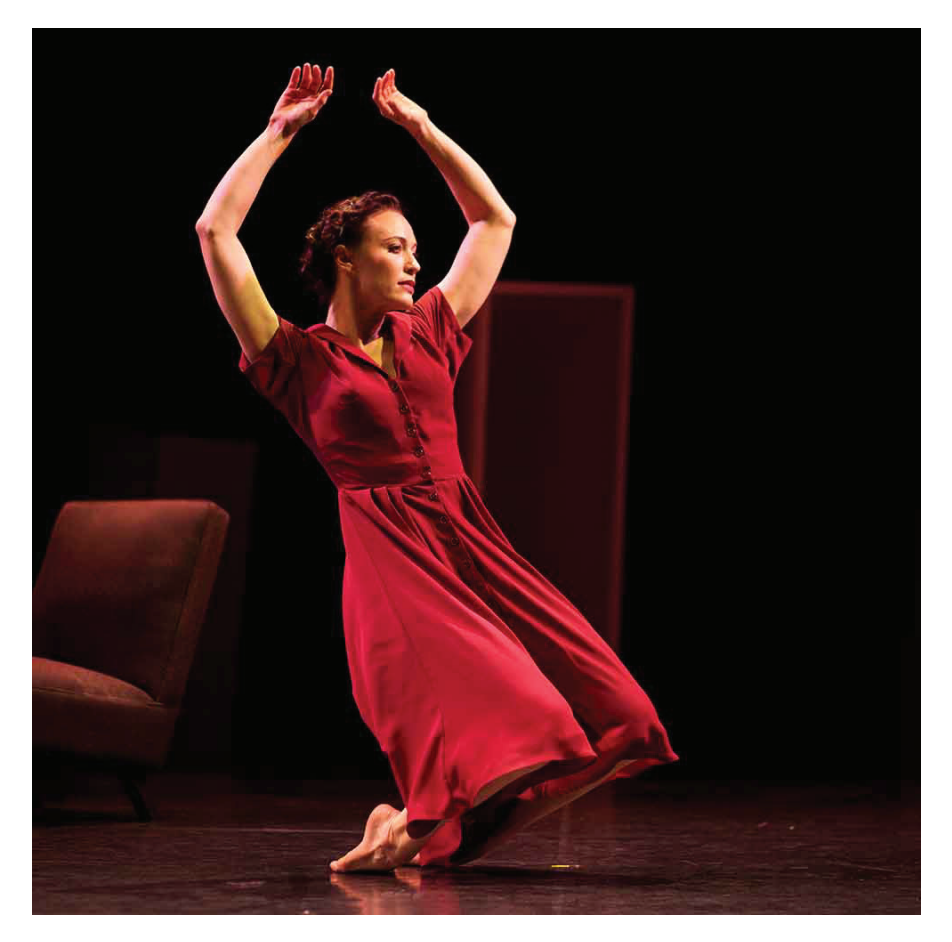
See next page