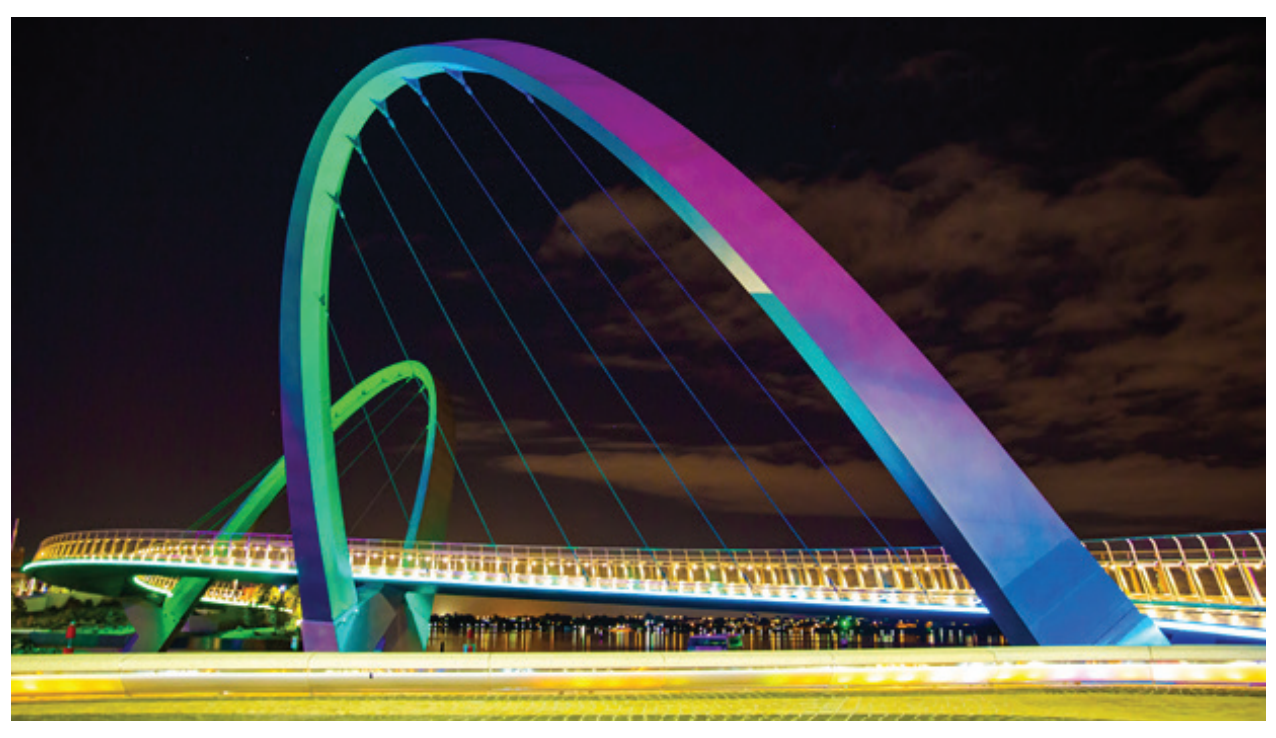
Figure 1: Elizabeth Quay Bridge, Perth. Designed by Arup Associates.