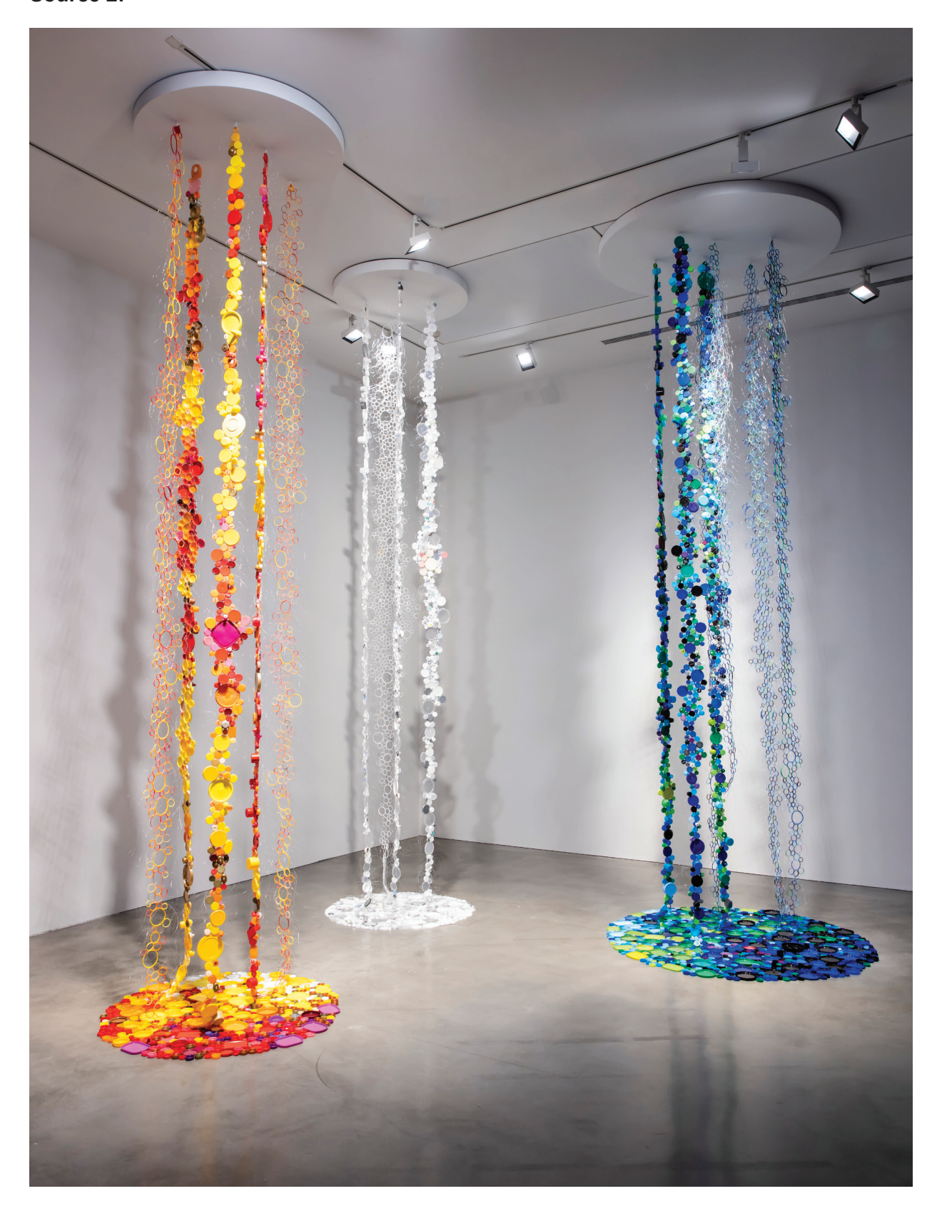
View 1: Fragile Ecologies (2020-21), Lauren Berkowitz Plastic bottle tops, lids 5 x 5 m

The National 2021: New Australian Art, Museum of Contemporary Art Australia, Sydney