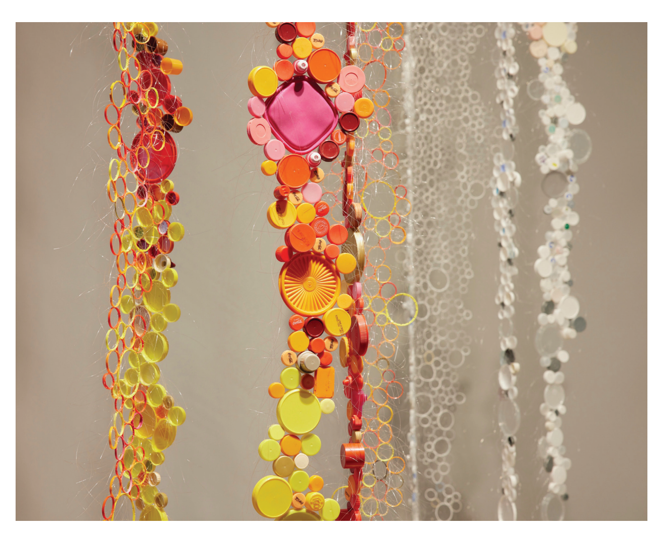
View 3: Fragile Ecologies (2020-21), Lauren Berkowitz Plastic bottle tops, lids 5 x 5 m (detail)

The National 2021: New Australian Art, Museum of Contemporary Art Australia, Sydney