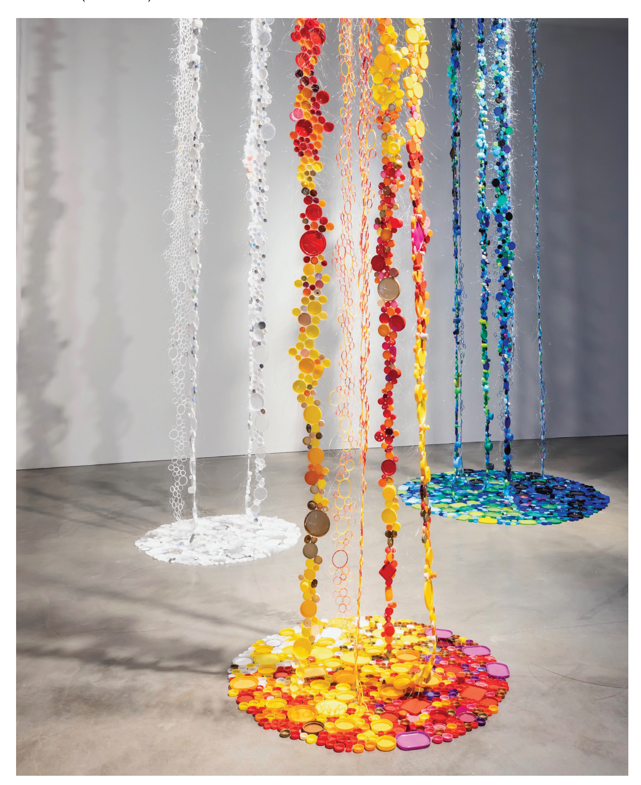
View 2: Fragile Ecologies (2020-21), Lauren Berkowitz Plastic bottle tops, lids 5 x 5 m (detail)

The National 2021: New Australian Art, Museum of Contemporary Art Australia, Sydney